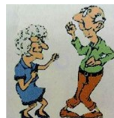
Poynton Golden Memories Group

Facebook: https://www.facebook.com/Poynton-Golden-Memories-Group-134533173798936/